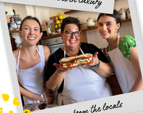
Learn from the locals