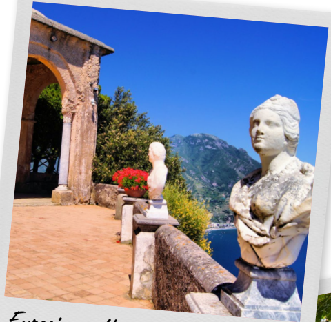
Experience the romance of Ravello

Dedicated Concierge Service: Throughout your stay, our on-the-ground concierge in Positano is at your service. Whether it's securing last-minute reservations, providing personalized recommendations, or guiding you to the perfect aperitivo spot at sunset, we're here to ensure your vacation is maximized to its fullest potential.