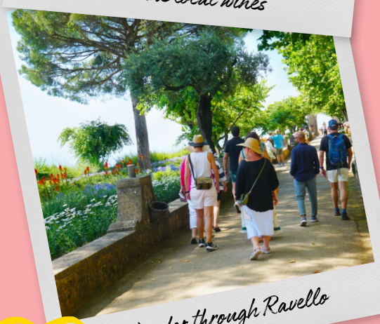
Wander through Ravello