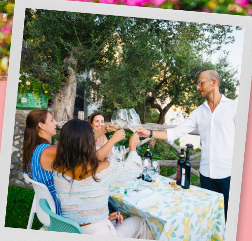
Taste the local wines

Savor the coastline's splendor aboard a private boat, uncover culinary secrets in a hands-on cooking class, and explore historic gems like Ravello and Pompeii with expert guides. With stress-free transfers and dedicated concierge service throughout your stay, we ensure an unforgettable Amalfi Coast experience that caters to your group's every desire.