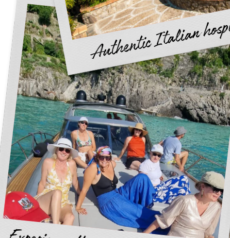
Experience the coastline in luxury