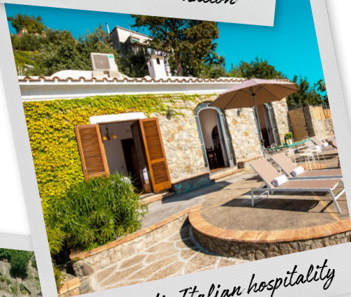
Authentic Italian hospitality