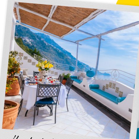
Hand selected accommodation

Hands-On Cooking Experience: Delve into the rich culinary traditions of Southern Italy with a hands-on cooking class led by a local chef. Learn to prepare authentic dishes using traditional methods and secret tips passed down through generations. Afterward, savor the fruits of your labor in a delightful meal, bringing a piece of Italy back home with you.