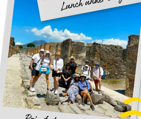
Private tour of Pompeii